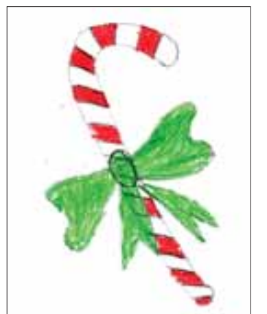
Brady Trout, Homedale Elementary